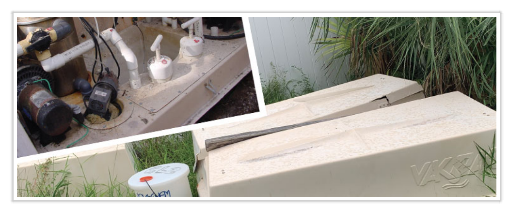
Before photos (not Regatta)