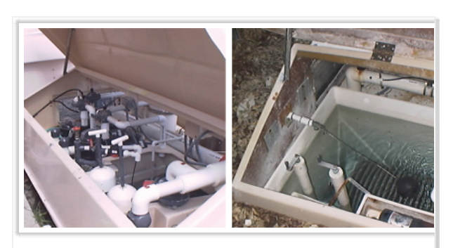
Before photos (not Regatta)

First, they've probably inherited a pool/spa mechanical system that might have been built many years ago, with a design commonly based on budget instead of operability and with an eye for economy rather than technology. Second, the systems might have been designed and built during an era when everyone had more time, maintenance staffing was much easier to contract, or the commercial pool service provided exactly what the condominium needed, so it was OK to have a more labor-intensive design.